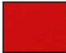
Crimson Red 26 gauge only