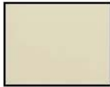
Light Stone 26 & 29 gauge