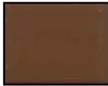
Koko Brown 26 & 29 gauge