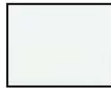
White 26 & 29 gauge