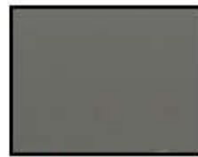
Charcoal Gray 26 & 29 gauge