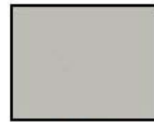
Ash Gray 26 & 29 gauge