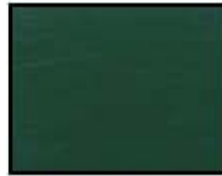
Fern Green 26 gauge only