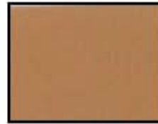
Copper Metallic 26 gauge only