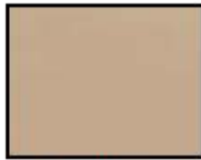
Saddle Tan 26 & 29 gauge