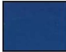
Gallery Blue 29 gauge only