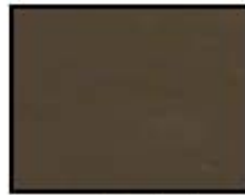
Burnished Slate 26 & 29 gauge