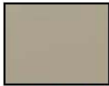
Desert Sand 26 & 29 gauge