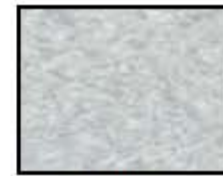
Galvalume 26 & 29 gauge

* Actual color may vary slightly from color samples shown. If color choice is critical, request an actual color sample.